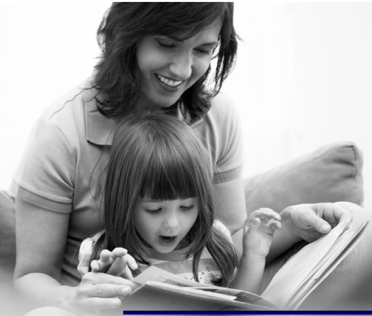
Connections has met the national standards of excellence set forth by the Points of Light Foundation and Volunteer Center National Network.